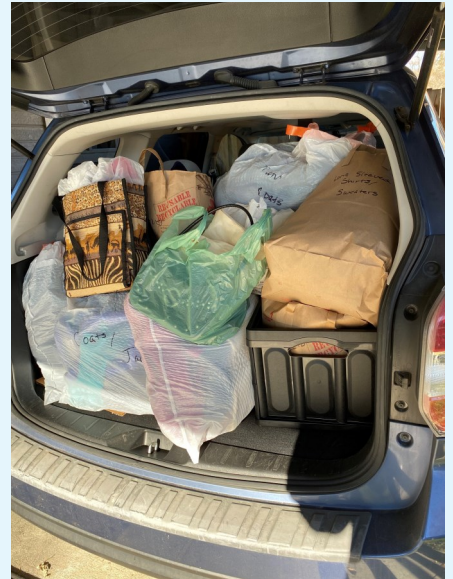
Photo on the right shows the generosity of this congregation - the 'stuffed' rear compartment of Charlotte's SUV with donated items!

Questions? Call Charlotte at 619-980-6752.