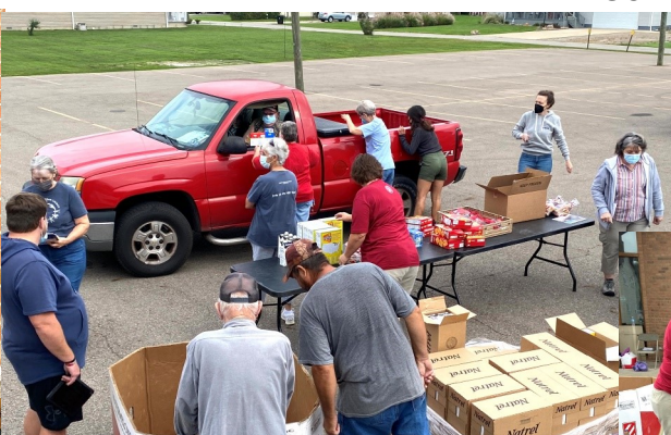
Photos below and to the left are from the October 2021 LSS Mobile Food Pantry