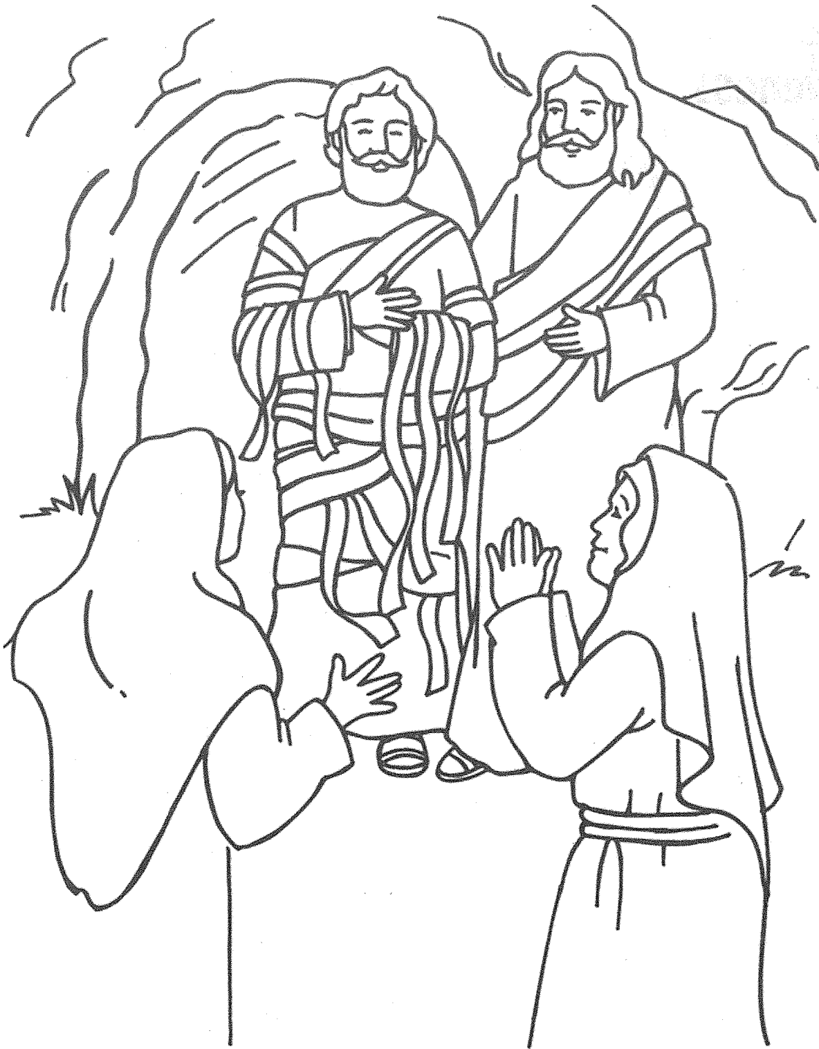
Jesus raises Lazarus. Luke 10 John 11

From Thru-the-Bible Coloring Pages for Ages 4-8. © 1986,1988 Standard Publishing.