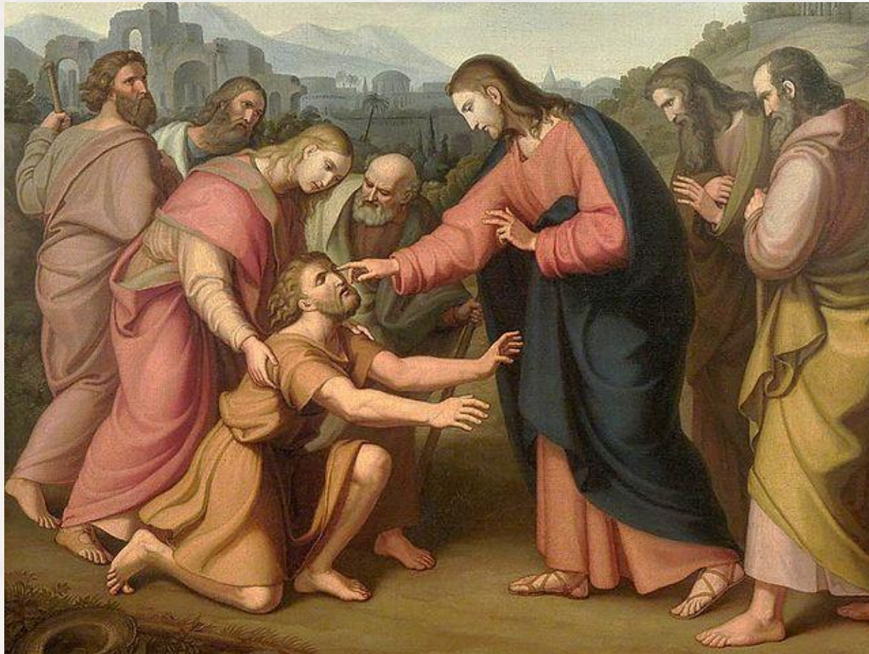
"Healing the Blind Man" 1832 by Vaclav Manes

Extra seasonal resources developed by Roots on the Web