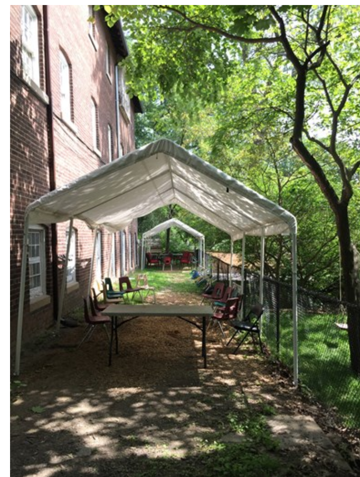
From tent church to tent church!

St. Aidan's began as a mission of St. John's Norway in 1891 with services being held in a tent on the south side of Queen St. near Balsam Ave and later at the foot of Spruce Hill Rd. 130 years later found us once again outdoors under a canopy when we held our Sunday evening services and meetings of a bereavement support group behind the school over the summer.