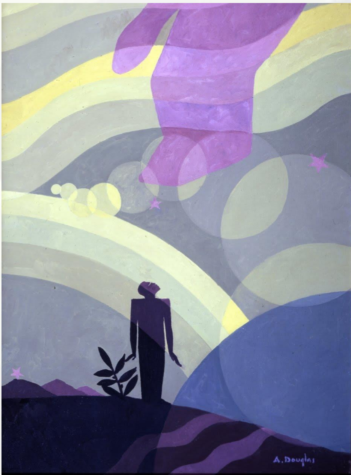
Aaron Douglas (American, 1899-1979), The Creation , 1935. Oil on Masonite. Howard University Gallery of Art, Washington, DC