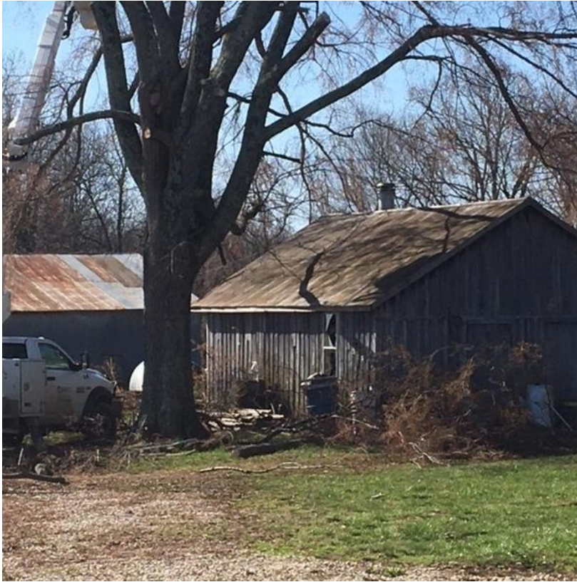
The original building used to be a garage.