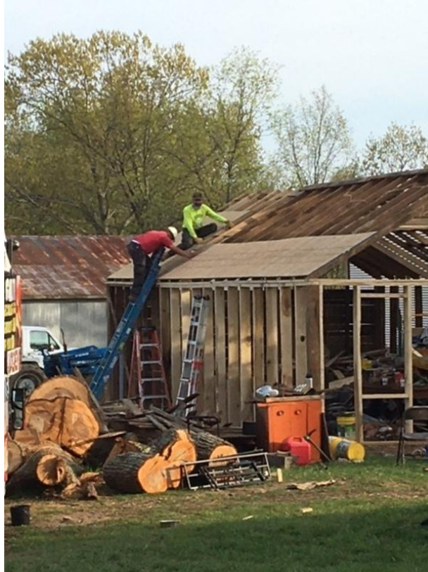
The building basically had to be reconstructed and strengthened before the roof could be put on. Our friend, Alan, came from NC to help us with help on this part of the job.