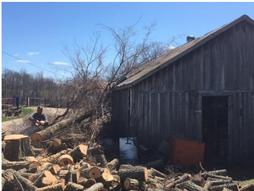
Usama removing the tree so it wouldn't fall on the building in the future. The wood will be used to heat our home for at least 3 years.