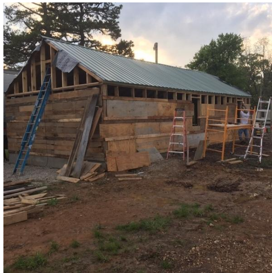
After the roof was finished the outside walls were covered.