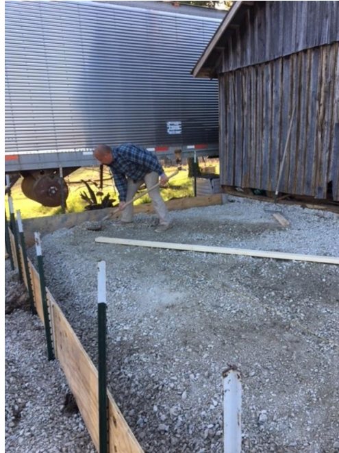
Usama building up the extension to make it ready for the concrete slab.