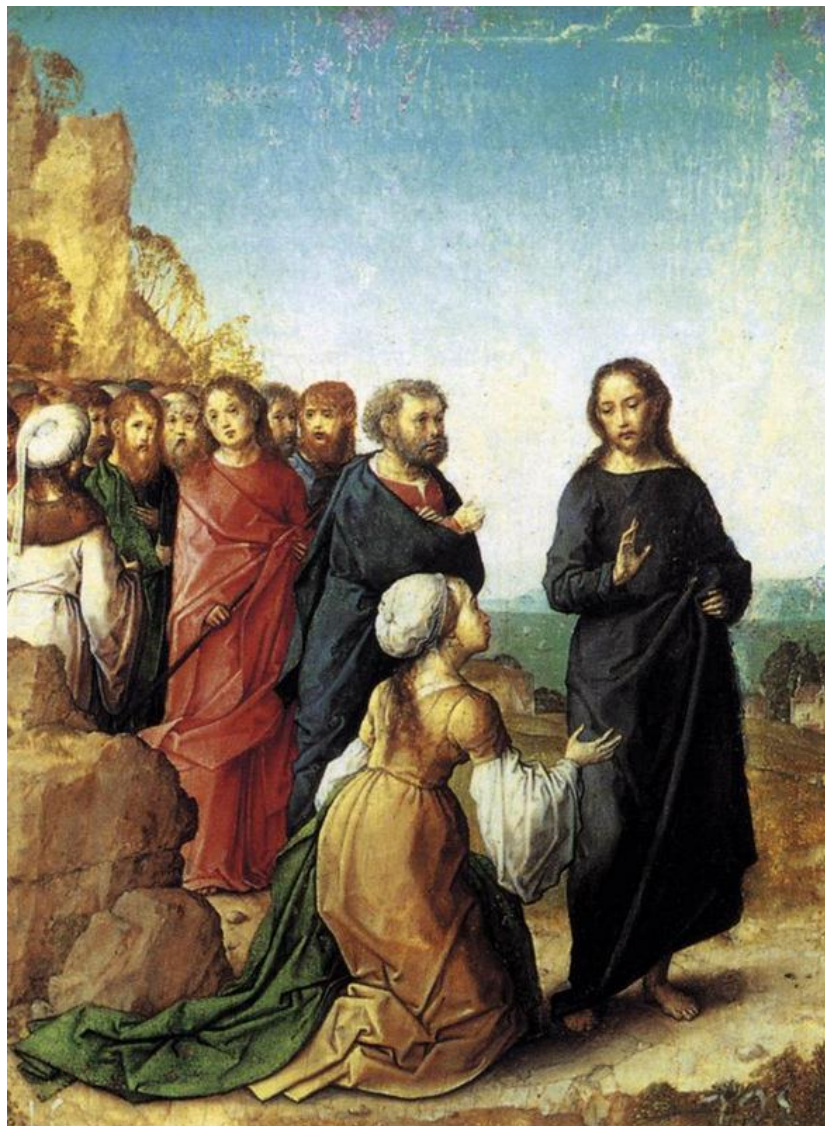
Juan, de Flandes, approximately 1465-1519. The Canaanite Woman asks for healing for her daughter

We are an inclusive and affirming parish; the sacraments of the church (baptism, communion and marriage) are available to all people on equal terms. Christ welcomes you, and so do we.