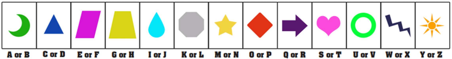
Figure out the secret code that tells the name of the Bible hero below. Each shape below represents TWO letters of the alphabet. First, identify the letters each symbol stands for, then read the clue to figure out which letter is a perfect fit! The clue is a Bible verse about this character, but it does not name the hero. If you can't figure out the hero's name, look up the verse in your Bible and read to help you find out who it is