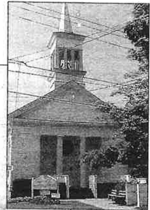
The Otisville-Mount Hope Presbyterian Church's 150th-anniversary celebration is about to begin.