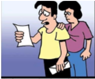
"Its from our church... we've been called up for active duty."