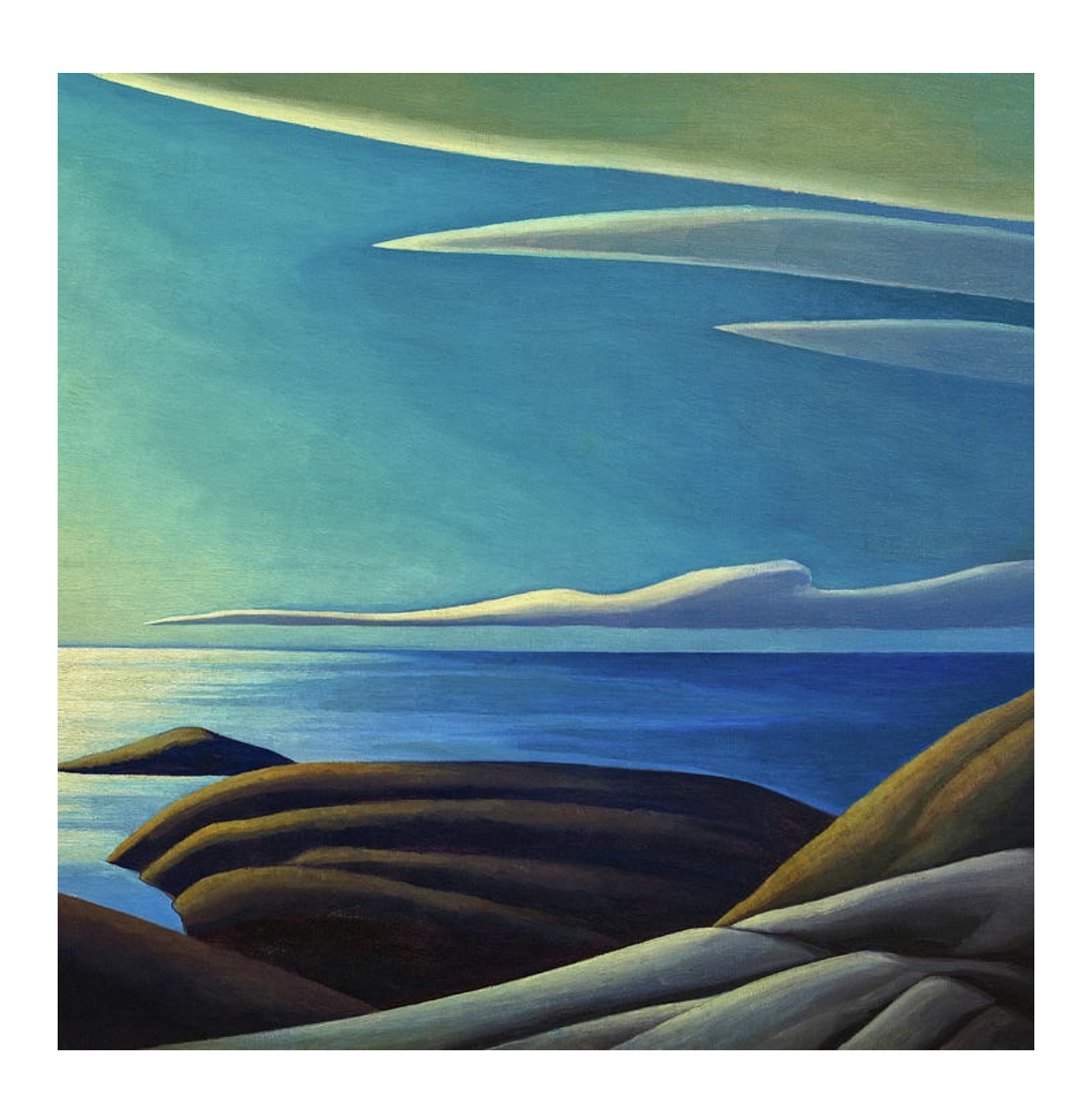
The Valley Bulletin, July 18, 2021