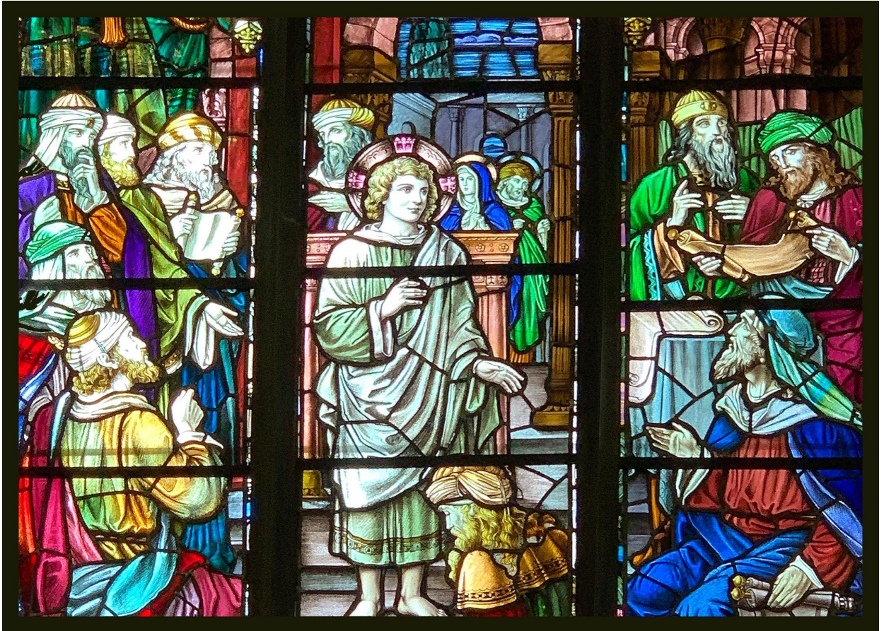
Jesus Teaches in the Temple - Metropolitan stained glass window