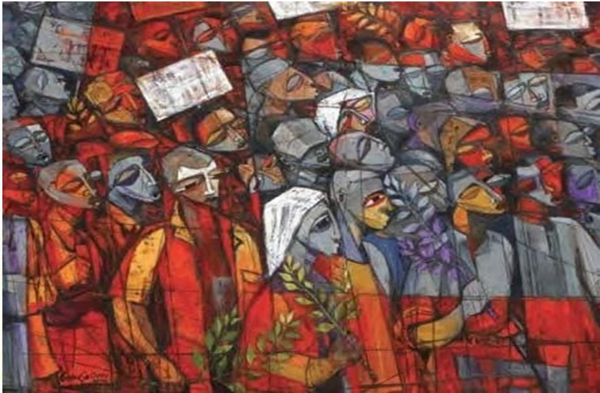
Artist: Gbenga Offo