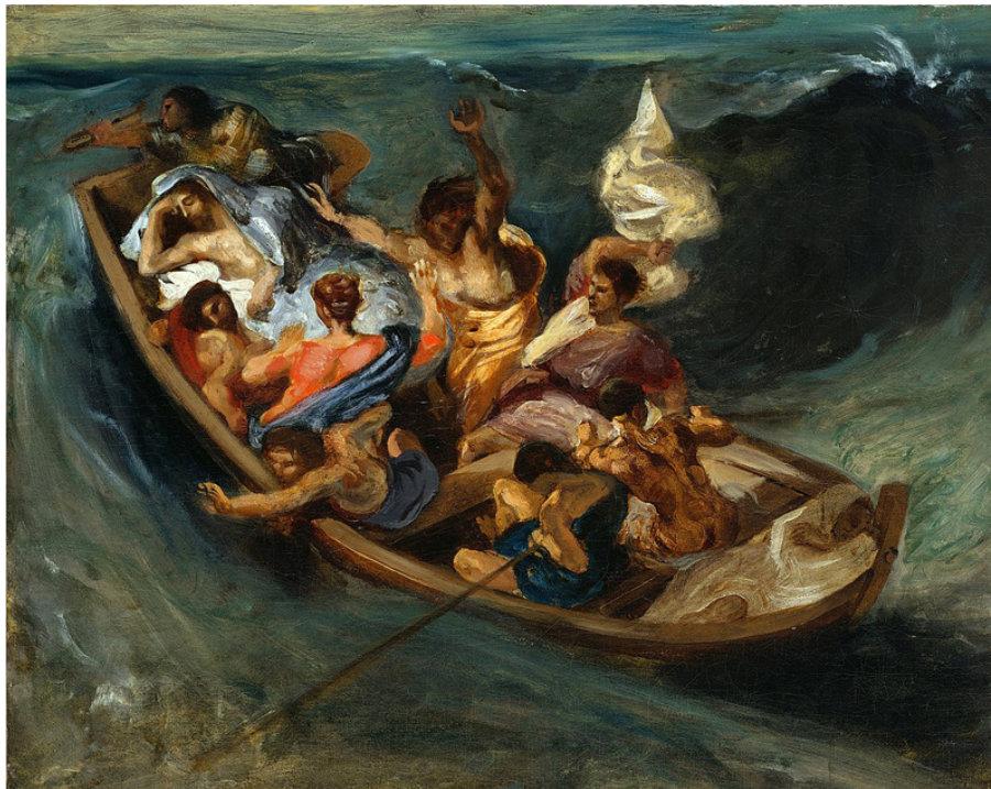
Artist: Delacroix, Eugène, 1798-1863

People: Glory to you, Lord Jesus Christ.