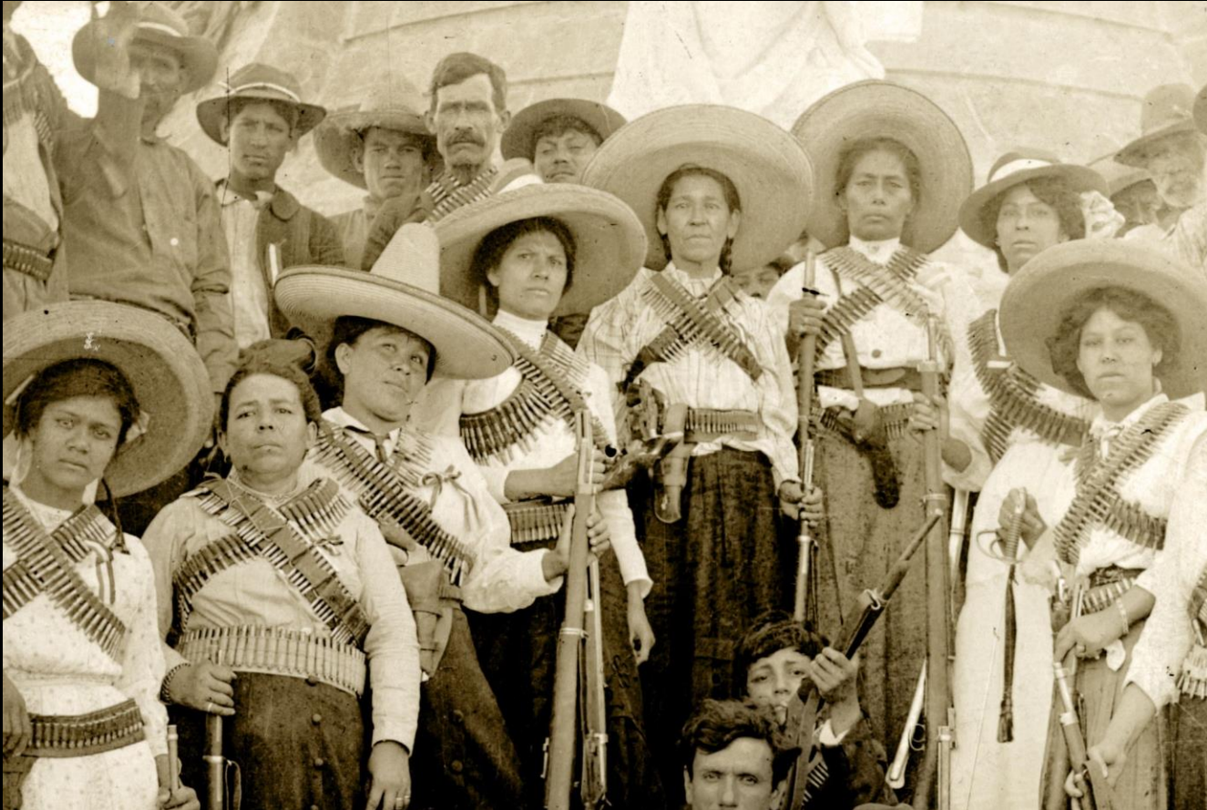
Las Soldaderas were women "fighters" who made significant contributions to both the federal and rebel armies of the Mexican Revolution.

"When I'd asked the names of the people they'd picked, they shouted out, all in a tumble: 'Benjamin Franklin!' 'George Washington!' 'Patrick Henry!' 'Sam Adams!'