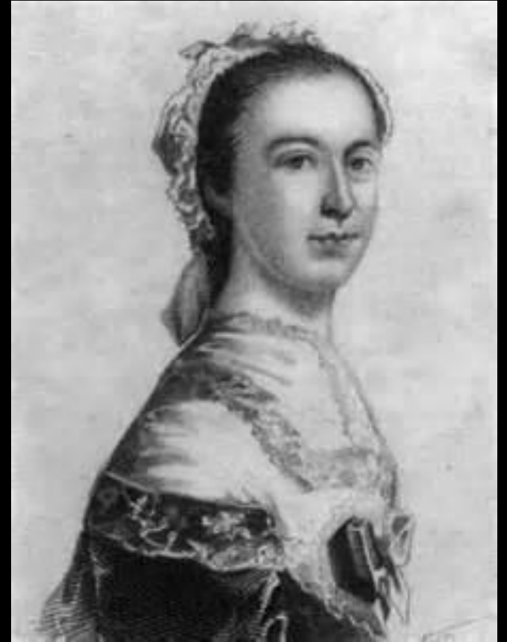
“Molly Pitcher” - Mary Ludwig Hays was a woman who fought in the American War of Independence at the Battle of Monmouth.

“‘Anyone here studying a woman?’ Silence. ‘Why not?’ I asked. And then a very little, very smart girl wearing a Spiderman T-shirt ... called out, ‘Because there were no women then!’ ”