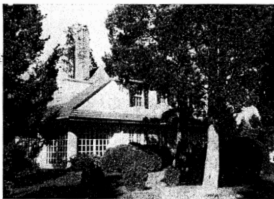
Above is the picture of our recently acquired property located five miles below Millville, N. J., known as "Cedar Knolls" one of the most attractive properties in the entire state. It consists of about 45 acres of beautiful wood land (mostly cedar) of the most beautiful to be found anywhere. It was acquired and liquidated in less than 12 months at a cost of $12,500. Its west and northern boundry is a beautiful stream suitable for fishing and boating. On the property is a beautiful cottage, garage and storehouse that could be easily made into a dwelling. In the years to come, many of the religious activities of the association and possibly that of the state and other religious bodies as well as civic, will be held here.

"A PEOPLE WITHOUT THE KNOWLEDGE OF THEIR PAST HISTORY, ORIGIN AND CULTURE IS LIKE A TREE WITHOUT ROOTS."