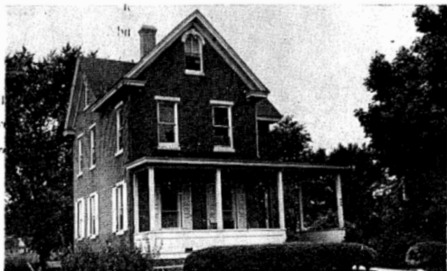
Above is the picture of the beautiful Bethany Home and Headquarters, located at 229 S. Barber Avenue, Woodbury, N. J. This is one of the finest properties in the City of Woodbury and is valued at about $12,000.