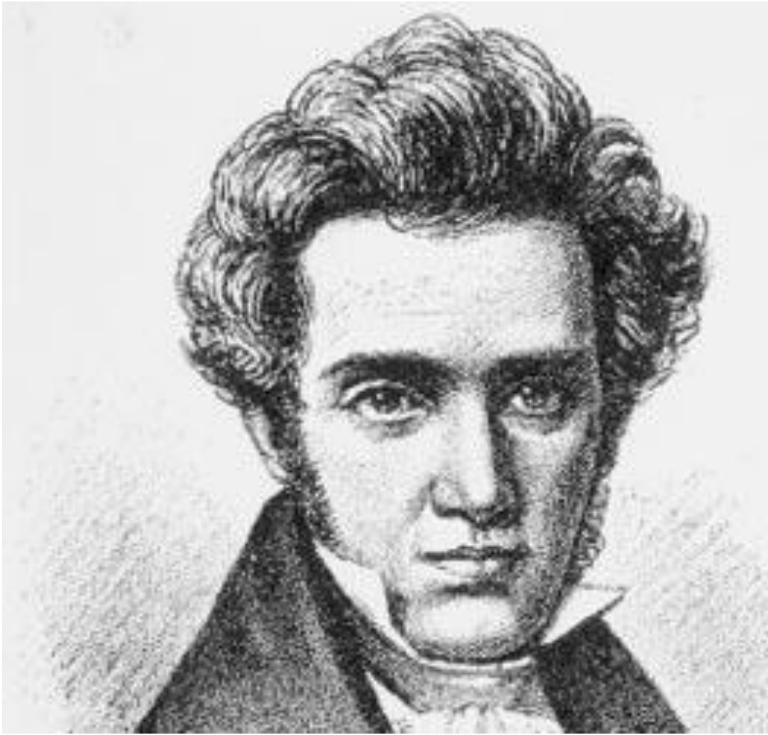
Soren Kierkegaard (1813-1855)

“What I really need is to get clear about what I must do, not what I must know, except insofar as knowledge must precede every act. What matters is to find a purpose, to see what it really is that God wills that I shall do; the crucial thing is to find a truth which is truth for me, to find the idea for which I am willing to live and die.”