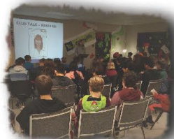
CLUB night March 2020

CLUB attendance was steady with an average of 35 kids at CLUB until Spring Break. We had a full talk sequence this semester and have a sequence of talks on the parables of Jesus for the first part of the year. We restarted CLUB in the fall and it was a bit of a slow start but we did see about 20 kids every week until mid November when the winter 'lockdown' started. CLUB transitioned to be at least weekly visits with kids either in person or virtually in November and December. Parents seemed to really appreciate that we were 'trying' and still checking in with kids. As part of CLUB we'll be dropping off special Christmas packages aka "covid Christmas connections" with a special hooded shirt, gift and hand written notes for every kid that we saw at CLUB nights this past fall.