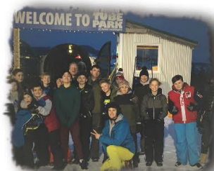
Mt Washington tubing trip February 2020

Our hope is to bring back Doug in a full time capacity, but with funding challenges we know it might not be until September or the beginning of 2022 for that to happen.