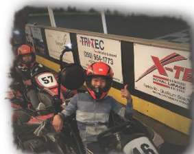
Go karting day as part of our summer day camp program