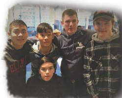
Snacktime after hiking Mt Washington July 2020