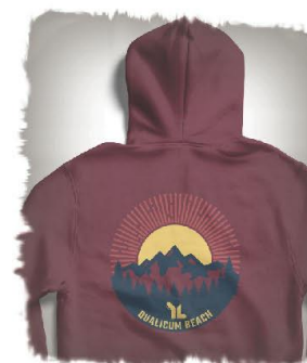
custom hooded shirts for kids (sponsored by Coastal Community CU)

Thanks for your continued support in prayer and financially.