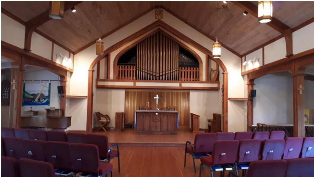
All Saints by-the-Sea (est. 1994) as we left the church in March for lockdown