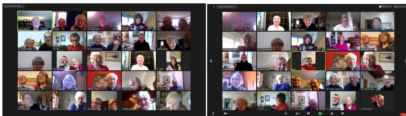
Zoom Coffee/Tea Party open to the congregation and former members – December 20, 2020