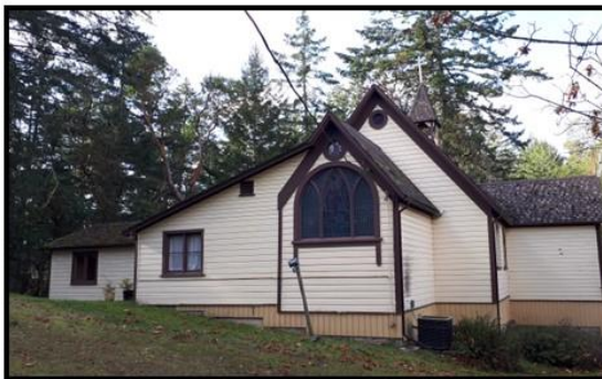
St. Mark's (est. 1892)