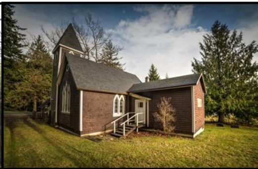
St. Mary's (est. 1894)

ANNUAL VESTRY MEETING SUNDAY, FEBRUARY 21st, 2021 by ZOOM