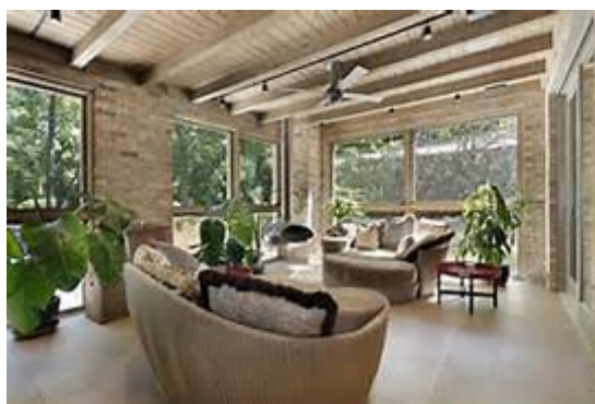
Vestibule not exactly as illustrated