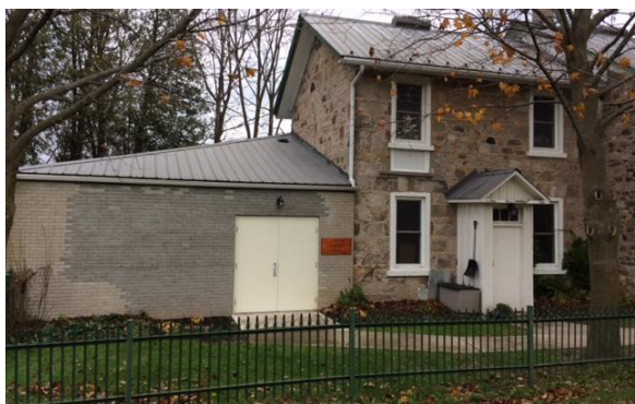
Vestibule to be located here