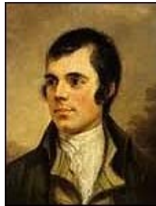
Robert Burns (1759-1796)

For Auld Lang Syne, my dear, For Auld Lang Syne; We'll take a cup of kindness yet For Auld Lang Syne.