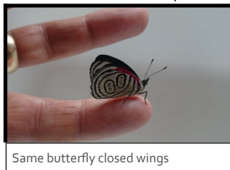
Same butterfly closed wings

As we live in a different country we find ourselves constantly amazed at the creativeness of our Creator. When learning a new language, it seems so simple to learn the word for “butterfly” (for example) but God didn’t create just a butterfly He created countless shapes, sizes and colors of them. Some colors are so bright and vibrant I could stare at it all day and not get bored.