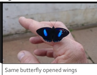
Same butterfly opened wings