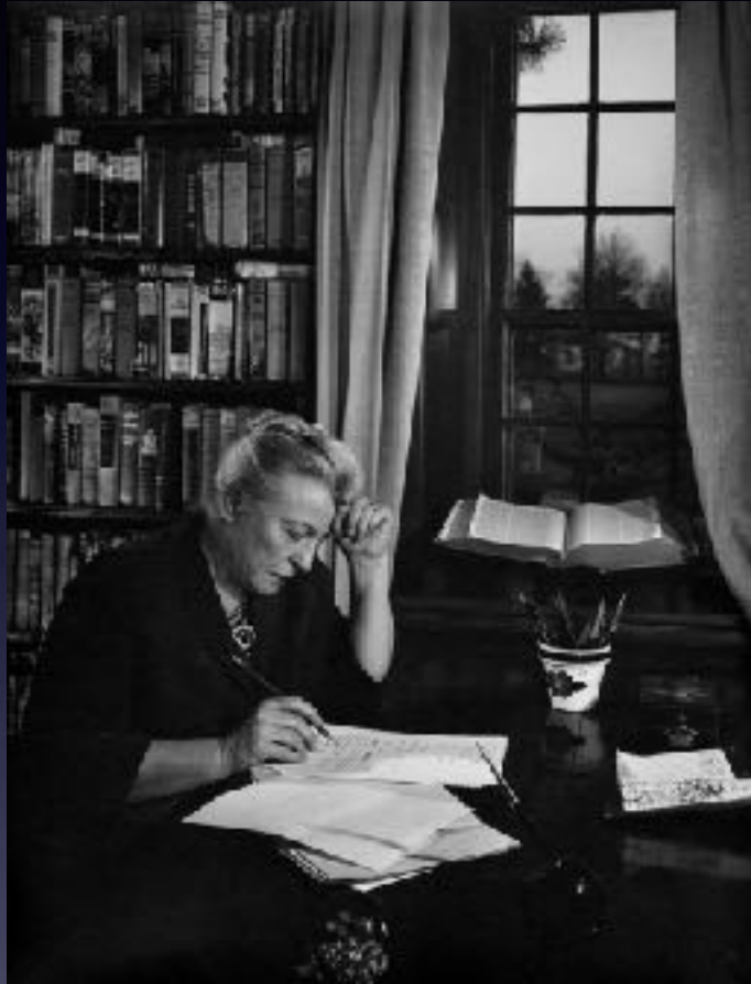
Pearl Buck, 1892 –1973.

American Novelist Pearl Buck grew up as a missionary kid in China. It caused her to compare -