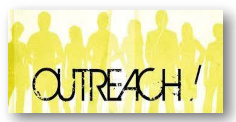
The Christ Church Gabriola Outreach Team asks you to consider donating new toothbrushes, toothpastes, dental floss, shampoos and soap as we make up personal hygiene kits for school children at Gabriola Elementary and for PHC.

Communion Services are held on the First and Third Sunday of the month.