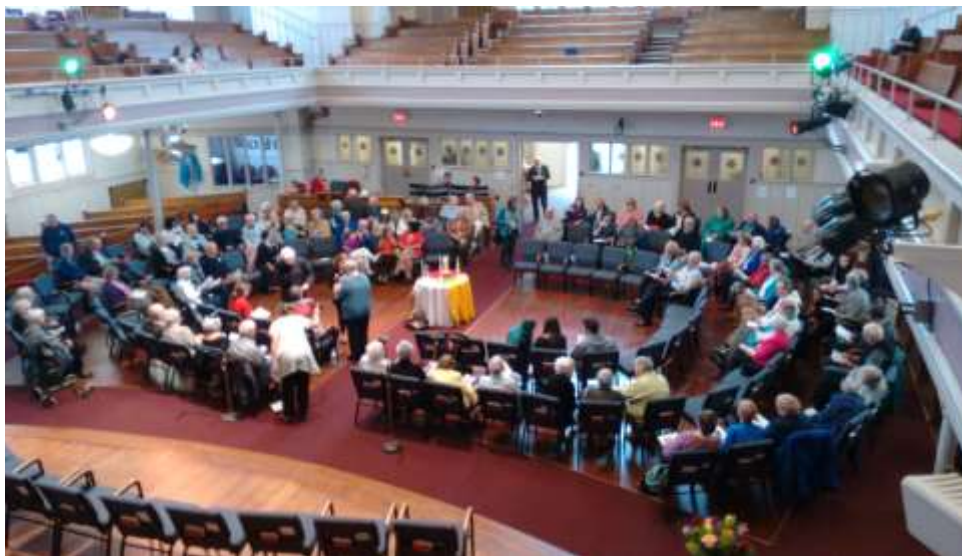
Church in the Round

218 items were borrowed from the library.