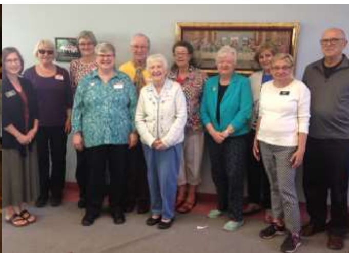
Umbrella group meeting in June