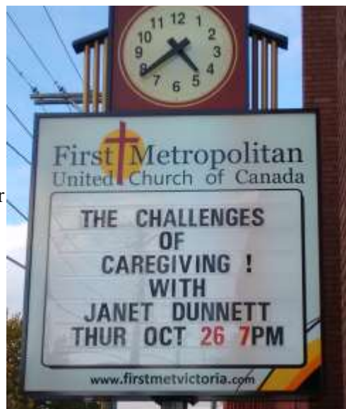
New Sign on Quadra Street