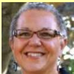
Ivy Thomas Interim Minister