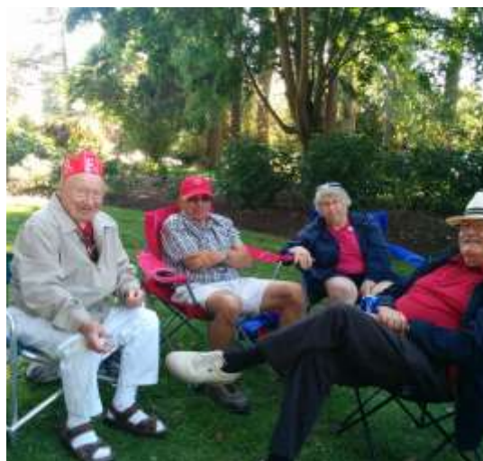
Celebrating 150 years of Canada At Beacon Hill Park