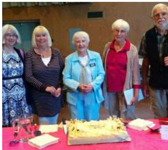
Volunteers & Volunteer Cake