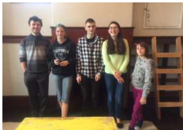
Youth in their new loft room