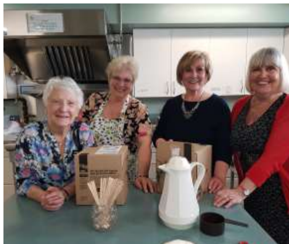
Hospitality volunteers in the kitchen