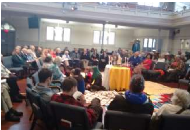
Blanket Exercise in the Sanctuary