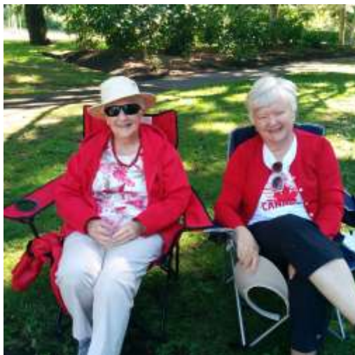
Canada Day at Beacon Hill Park

The Hospitality Committee extends our deepest gratitude to ALL our staff and many other volunteers who have supported our ministry in a myriad of ways this past year.