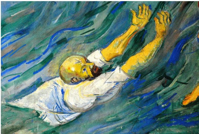
Art by Herbert Boeckl (1894-1966)

People: Glory to you, Lord Jesus Christ.