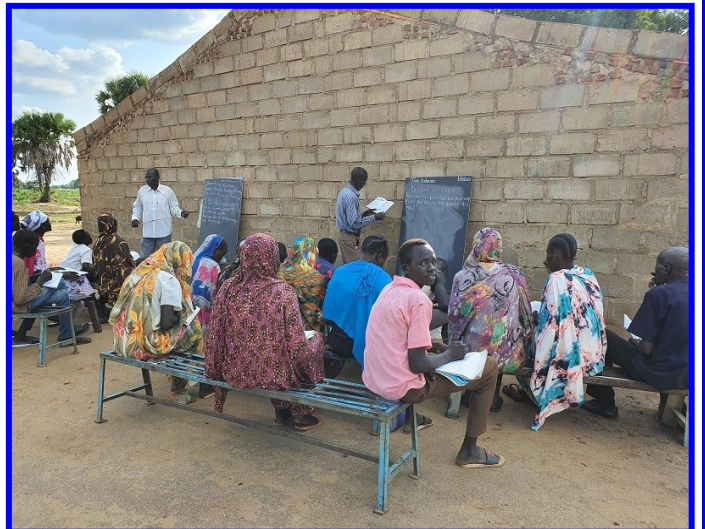
Bounj Church Mabaan Language Class

Several Mabaan churches have started Bible studies during the week. There are Bible studies in Mabaan language & an English Bible study. There were young people who began attending who could not read either Mabaan or English, and so the church started up Mabaan & English language classes. Our church in Doro has a small language class as well. The Lord is doing amazing things here. I'm beginning to see that God had to get us out of the way long enough so that He could work. And now, our Mabaan pastors are testifying to us of what God is doing amongst them. Please continue to pray for our Sudanese & South Sudanese Churches, that God's Spirit will continue to give our pastors a vision of His plan. And pray for the hearts of the young people, that He would transform their lives for His glory. God is so good. God is continuing to build His Church!