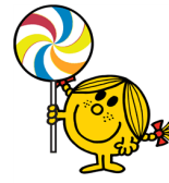
little Miss Sunshine