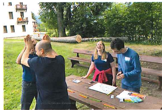
Family camp fun builds relationships that build trust.