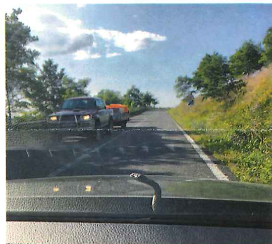
An unwelcome, venomous hitchhiker showed up on our team's ride from the village to Resita.

• When the Romanian camp ended, our team did children's ministry for the third time in a village where one of our four JP staff grew up. She and the other career staff have provided Christmas hampers for the poorest of the poor in that region for about a decade.