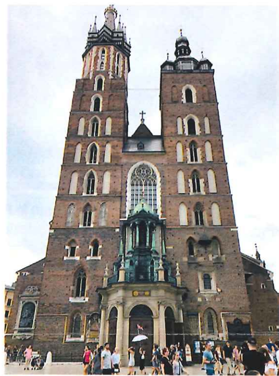
Relationship with Jesus, not merely religion, is what's missing.