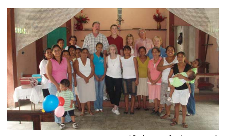
"Gathering at La Anunciacion"

Guatemala Cuisine along with some "Market Day" items will be available.