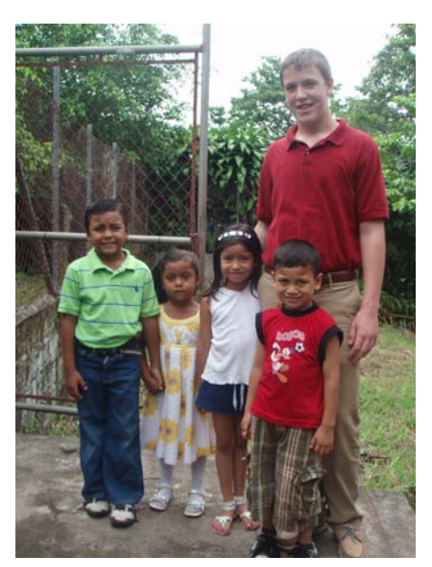
"Grande boy gathers with friends"