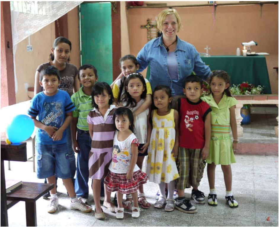
We're going to Guatemala again in April! We're going to paint one church, put a new roof on another church, and do some school projects with a lot of kids. We need to buy paint, roofing materials, and craft stuff. Will you contribute some money to help us buy those things?