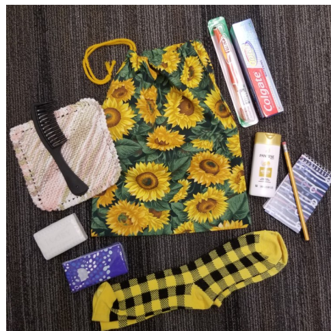
Photo of one of the handsewn joybags sent to our Northern communities

Secretary, St Paul Anglican Church Women.