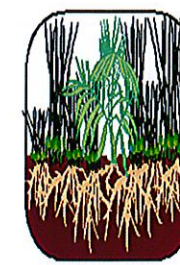
The Weedy Soil