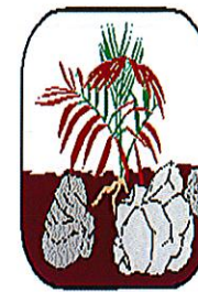
The Rocky Soil