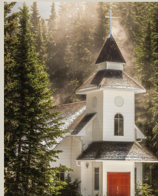
Camp Caroline Chapel

Sun. February 2 to Wed. February 5, 2020 at Camp Caroline