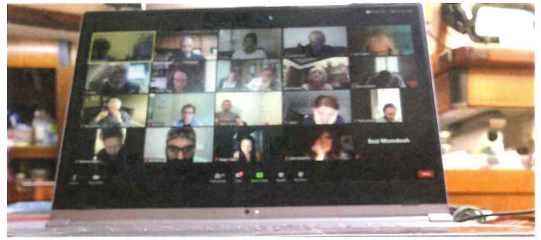
Zooming with staff from Canada, Poland, Lebanon, Uganda, USA, Ukraine, Romania, Turkey, & Egypt

We anticipate having more opportunities to do the same in other regions.