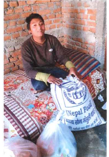
Husband welcomes a delivery of emergency food to help his family in Nepal survive the coronavirus pandemic

Please clip and mail this form along with donations.