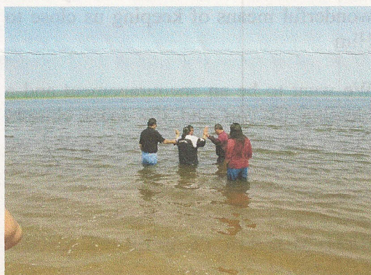
A believer experiences water baptism.

One baptized participant told me that he had had a dream two weeks earlier of a coffin floating out into the bay towards the sea. And he said that was symbolic of his old man being buried at sea once and for all.