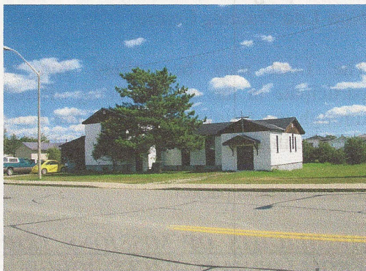
Senneterre Mission Church

Also we would like to come and share with congregations during your missions conventions. We will be contacting some of you and if you don't hear from us, please give us a call to set an appointment. The work goes on and on for the Kingdom of God.