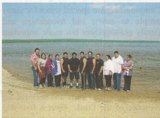
Twelve baptized believers gather for a picture.