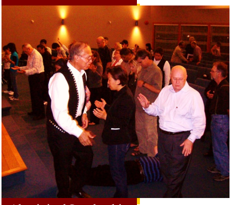
Aboriginal Leadership Summit