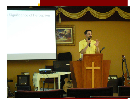
Teaching in Waswanipi