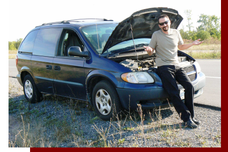
Just waiting for the tow truck to arrive