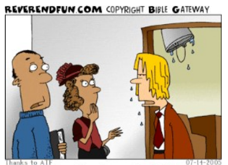
WATCH OUT ... IT'S SURPRISE BAPTISM

WHY, GOD, WHY? - Why do we suffer? Does God cause bad things to happen? If not, why does he even allow them? How can we maintain faith in God when everything is going wrong? Study Job 1-3 with Groundwork to see. Listen now at GroundworkOnline.com