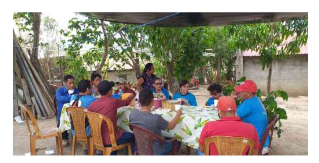
Lunch offered from the families of Las Canoas, to the Staff of CyM and Municipality

The families benefited from Las Canoas, offered a delicious lunch to the Corazones y Manos staff and to the municipal authorities, in gratitude for the Stove Project.