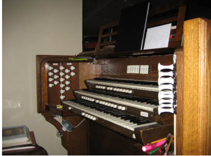
Pipes & organ console at All Saints-by-the-Sea