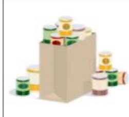
Food Pantry Resources & Information

Synods Have Their Resources and Connections