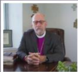
From Our Bishop & Leaders

By implementing safe practices and looking out for one another, WE ARE CHURCH TOGETHER!