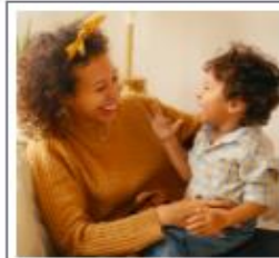
Recursos en Español