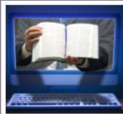
Digital Worship & Communications Resources