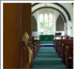
Resources Regarding the Reopening of Church Buildings