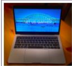
MNYS Digital Services of the Word