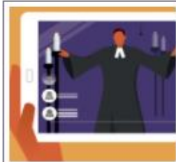
MNYS Congregations' Digital Service of the Word