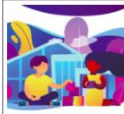
Resources for Our Children