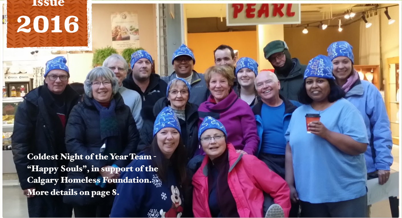
Coldest Night of the Year Team - "Happy Souls", in support of the Calgary Homeless Foundation. More details on page 8.