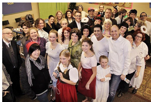
The cast of It's a Wonderful Life