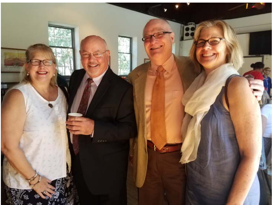
(Hospitality after Lucia Sunday Service)