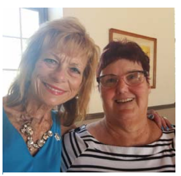
Tea Party attendees.

All proceeds from the event were donated to Thistle Farms. The mission of Thistle Farms is to heal, empower, and employ women survivors of trafficking, prostitution, and addiction. Thistle Farms does this by providing safe and supportive housing, the opportunity economic independence, and a story community of advocates and partners. Thistle Farms believes that, in the end, love is the most powerful force for change in the world. $50 was donated from the Rector's Discretionary Fund toward this event.