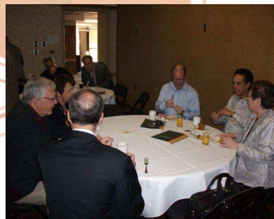
Some of the General Conference breakfast attendees