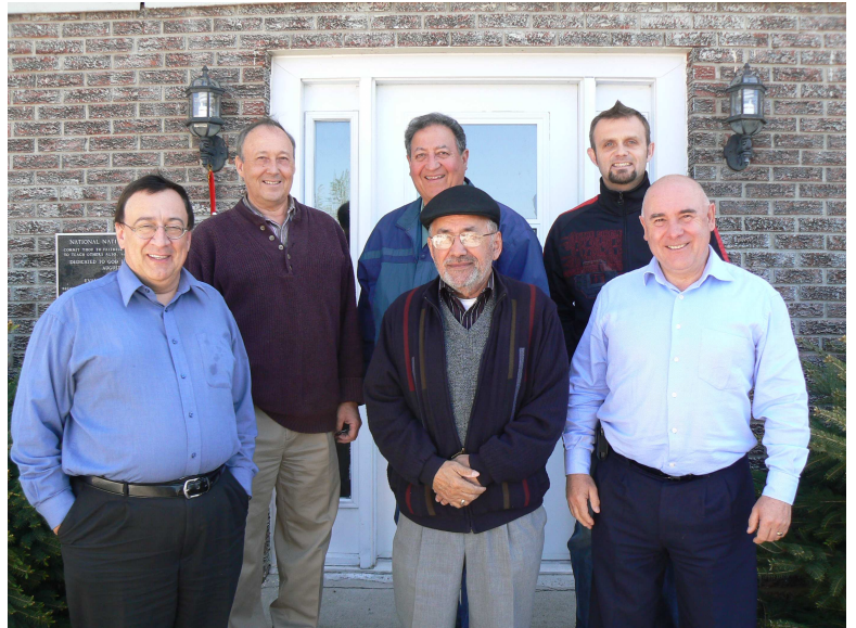
ABA Board of Directors