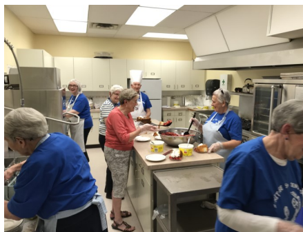
Heritage Seniors Strawberry Tea