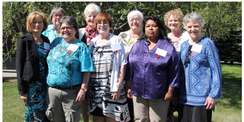
Our first group of Stephen Ministers commissioned on May 27, 2018

A brochure can be found on the Pastoral Care rack in the Karl English lounge.