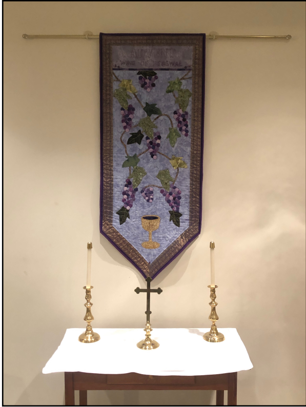
The Advent Wine of Renewal Quilt