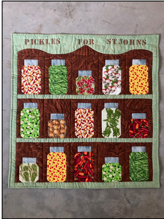
Pickle Jar Quilt

A quilt can be made from any subject that you can think up.