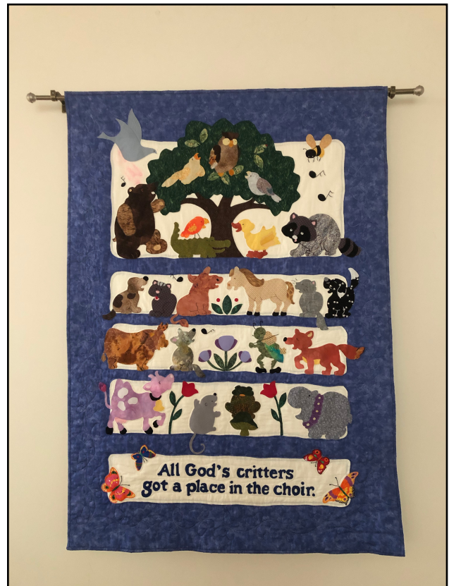
The Critters Quilt