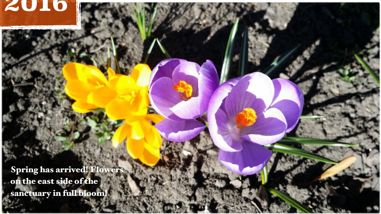
Spring has arrived! Flowers on the east side of the sanctuary in full bloom!