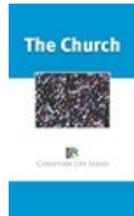
The Church is Course 4 in Unit 1

The Christian Life Series is an 18 course study, divided into three units of six courses each, to help students grow in their relationship with Christ, interact with the Word of God, and better understand God's purposes for their life.